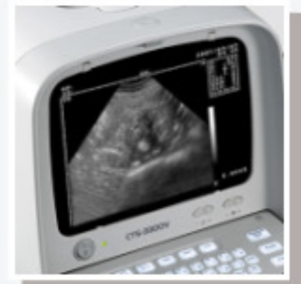
10-inch High Resolution Monitor