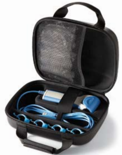
Spirometer carrying case

For information, pricing or to place an order, contact us at: 1-800-624-8950 or 1-310-516-6050 or midmark.com