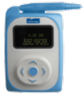
IQholter™, EX, EP